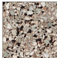
3607 CAFE BROWN