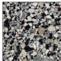
3604 FRENCH GRAY