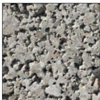
3601 GRANADA WHITE

DETAILS: VISIT STEPSTONEPRECAST.COM FOR DRAWINGS AND DIMENSIONS