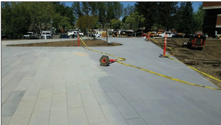
An efflorescence removal job in progress; before (left) and after cleaning (right).

No. These can be found at your local masonry dealer. Eagerly, we'll refer you to a Stepstone Dealer in your area within the state of California.